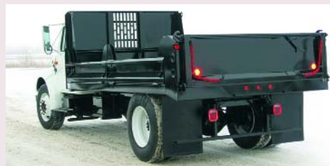
The Crysteel Contractor Body truck.