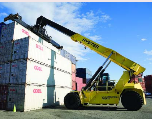
Hyster's Yardmaster II reach stacker.